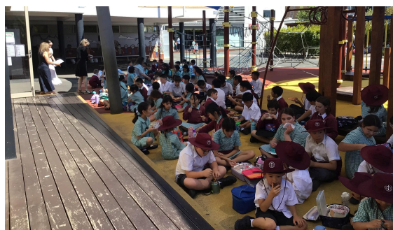
Our Preps and their Year 5 buddies having lunch together.